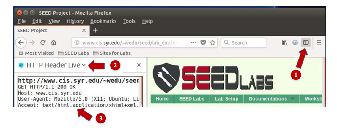
Figure 1: Enable the HTTP Header Live Add-on

The version of Firefox (version 60) in our Ubuntu 16.04 VM does not support the LiveHTTPHeader add-on, which was used in our Ubuntu 12.04 VM. A new add-on called "HTTP Header Live" is used in its place. The instruction on how to enable and use this add-on tool is depicted in Figure 1. Just click the icon marked by ①; a sidebar will show up on the left. Make sure that HTTP Header Live is selected at position ②. Then click any link inside a web page, all the triggered HTTP requests will be captured and displayed inside the sidebar area marked by ③. If you click on any HTTP request, a pop-up window will show up to display the selected HTTP request. Unfortunately, there is a bug in this add-on tool (it is still under development); nothing will show up inside the pop-up window unless you change its size (It seems that re-drawing is not automatically triggered when the window pops up, but changing its size will trigger the re-drawing).